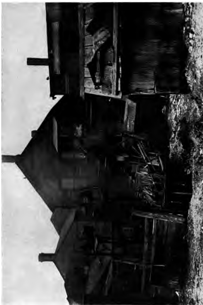
A CASE FOR ENVIRONMENTAL SALVATION